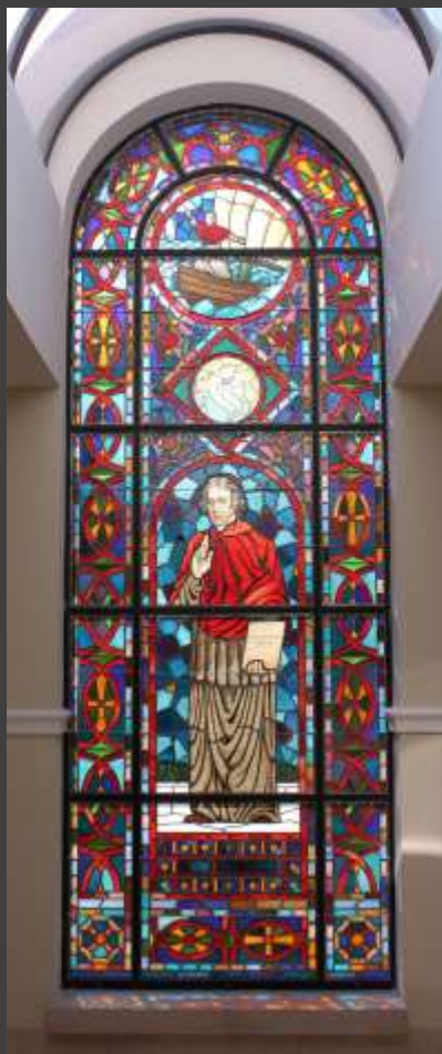
Venerable Frederic Baraga First Bishop of Marquette

311 West Baraga Avenue, Marquette, MI 49855 | Office hours: M-Th 9am-4pm; F 9am-12pm | (906) 226-6548