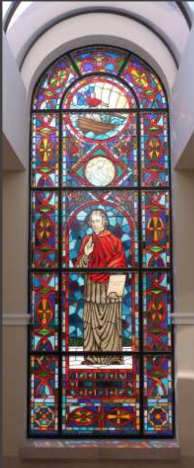
Venerable Frederic Baraga First Bishop of Marquette

311 West Baraga Avenue, Marquette, MI 49855 | Office hours: M-Th 9am-4pm; F 9am-12pm | (906) 226-6548